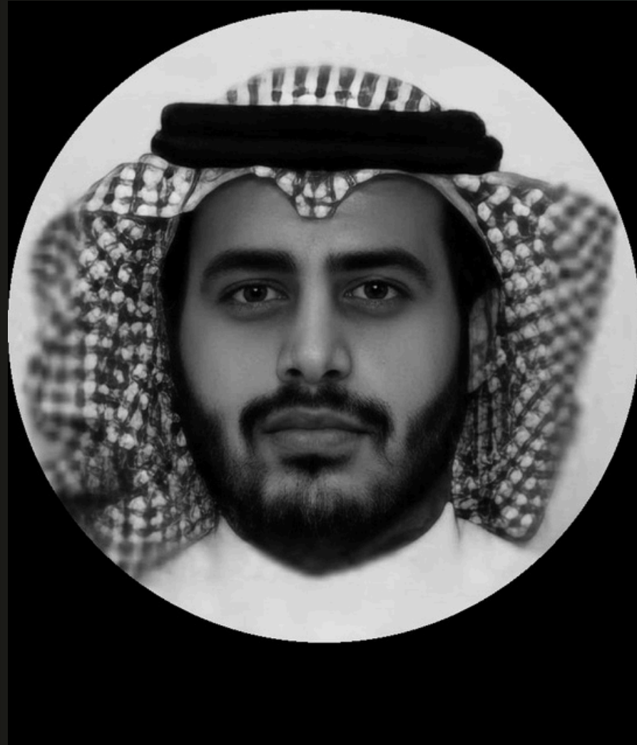
Chairman of the Board